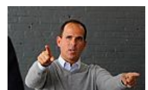
The #1 Reason