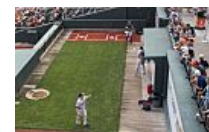
Brett Oberholtzer Wins in First MLB Start