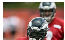
Eagles training camp July 23