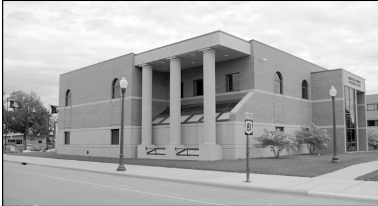
Yankton County Commission meetings are held at the Yankton County Government Center on the first and third Tuesdays of each month, starting at 4 p.m.

Editor's Note: This is the fourth story in an Observer series titled "In a Minutes Notice." These articles highlight information and news value in meeting minutes and other public notices in newspapers. Part four compares Yankton County Commission pay with other counties in the state and region.