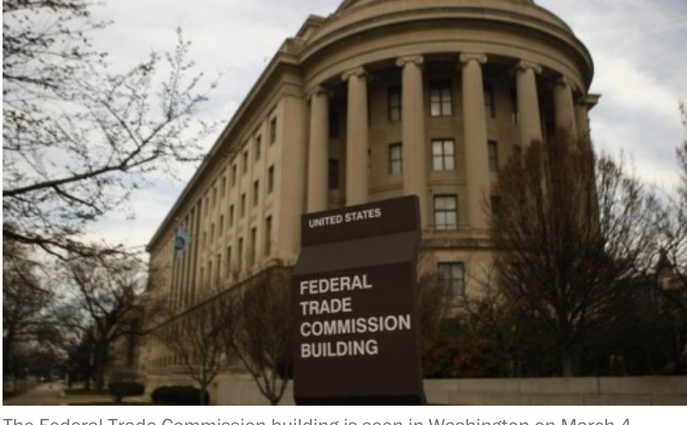
The Federal Trade Commission building is seen in Washington on March 4, 2012.