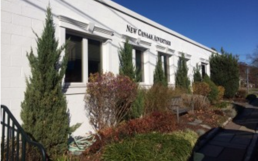
The Vittti Street offices of the New Canaan Advertiser on Nov. 17, 2015.