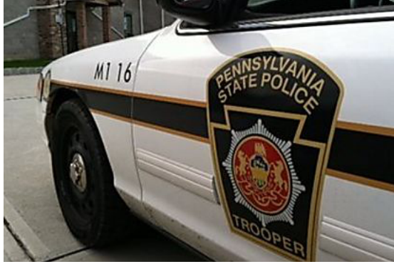
20-year-old dies after Route 33 high-speed crash, cops say LehighvalleyLive.com