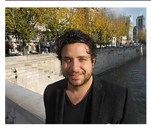
Aged 35 he speaks 11 languages - his 11 tricks to learn any language Babbel