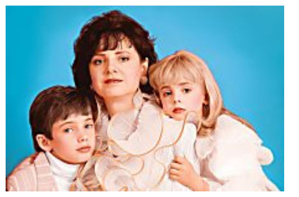
JonBenet Ramsey's Murderer Revealed National Enquirer

United States of Pizza: The Best Slice in All 50 States Food Network