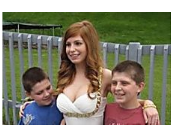
Bizarre Family Photos That Will Make Your Skin Crawl Your Daily Dish