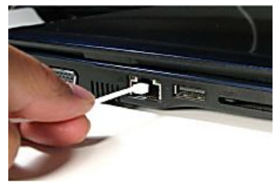
Do Not Use The Internet In The U.S Today..Until You've Read This Smarter Web Life