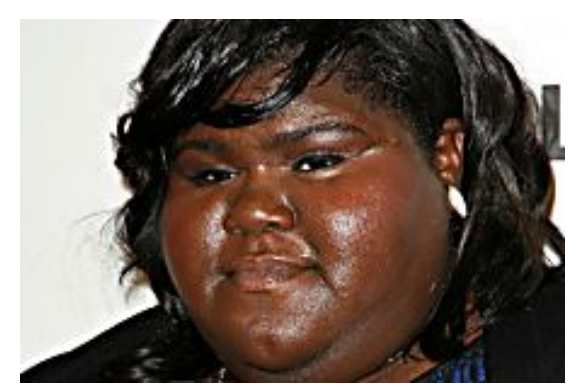
You Won't Believe What She Looks Like Now OK! Celeb